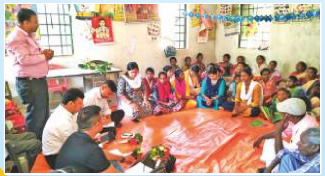
With objectives to reduce Child Marriage, to increase Secondary Education and to lessen Teenage Pregnancy in 6 blocks of East Singhbhum district.